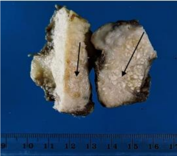
Plate I: Cut surface of cutaneous mass showing multiple whitish calcified plaques (black arrows)

disease (e.g. leptospirosis). Furthermore, conditions causing inflammation in the skin, such as follicular cysts, foreign body granulomas, interdigital pyoderma, demodicosis or pilomatrixomas, or those that after trauma results in inflammation, degeneration or necrosis, have also been reported to be associated with dystrophic calcification and ossification (Gençcelep et al. , 2018). Idiopathic calcification affects healthy soft tissues (Gençcelep et al. , 2018; Sabater et al. , 2016).