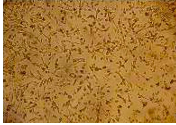
Plate II: BHK- cells monolayer infected with vaccine virus prior to staining with FITC Conjugate