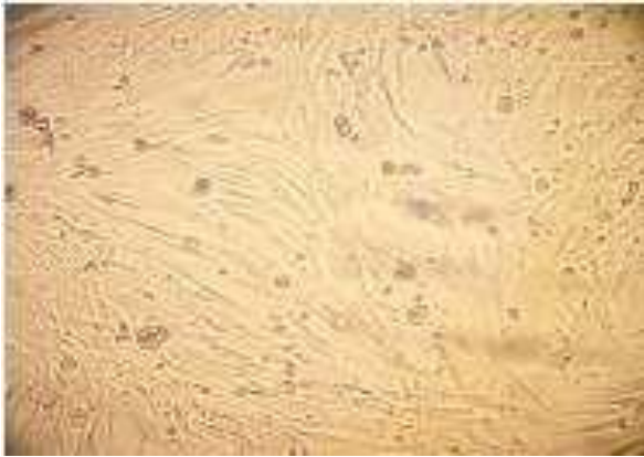
Plate I: Uninfected BHK-cells monolayer before staining with FITC Conjugate

clear and abundant evidence of rabies virus antigen presence in the infected BHK-21 cells (Plate I) and complete absence of rabies antigen in the control wells Plate II), as obtained after microscopy. The application of the 'Spearman Karber' (Karber, 1931) method (Table 6) showed that all the screened vaccine batches were well within the acceptable TCID_{50} titre value range for rabies vaccine intended