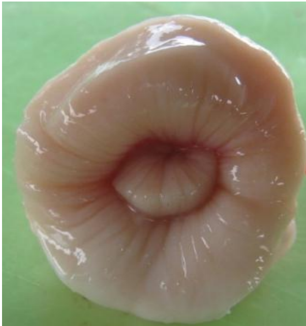
Plate III: Cervical ring projecting into the cervical canal