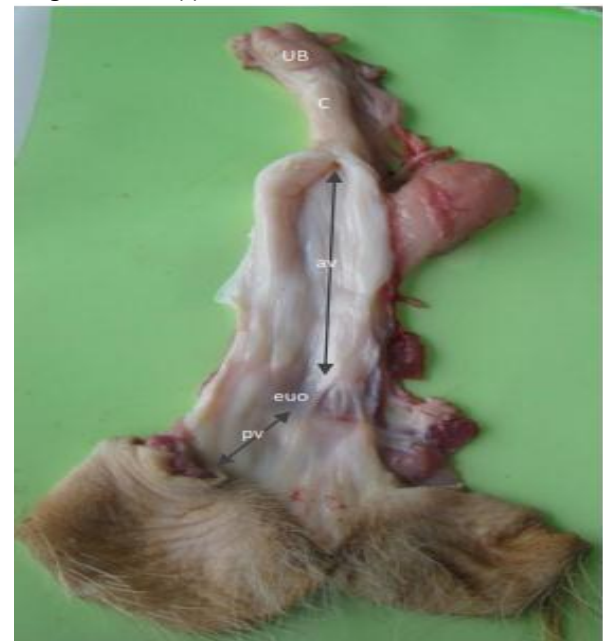
Plate IV: Non-gravid reproductive tract of R. timorensis showing the uterine body (UB), cervix and vagina. NOTE: The vagina is divided into anterior vagina (av), posterior vagina (pv) and external urethral orifice (euo).