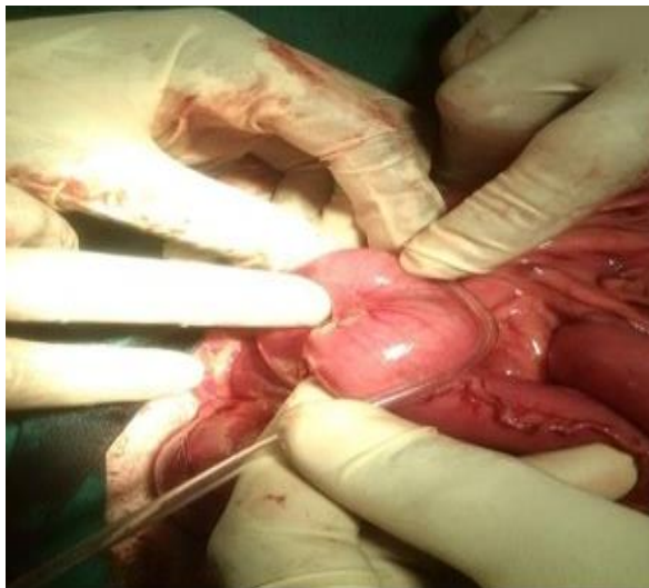
Figure 3: Measurement of large intestinal length using sterile drip set

intestine were identified. The thumb and the index fingers were gently inserted into the abdominal cavity and the large intestine was exteriorized and placed on laparotomy pads (figure 2). A sterile drip infusion set was used to measure the length of the individual segment of the large intestine beginning with the caecum, colon and rectum in that order; colon and rectum were measured together (figure 3). After each measurement, the drip set was placed on a calibrated metre rule to determine the length in cm. The large intestine was then gently returned into the abdominal cavity. The abdominal incision was closed in three layers. The peritoneum was closed with chromic catgut (Anhu Kangning Industrial Group, Co. Ltd, China gut) size 3-0 using a simple continuous suture pattern. The subcutaneous tissue was closed with a subcuticular suture pattern using chromic cat (Anhu Kangning Industrial Group, Co. Ltd, China gut) size 3-0 and the skin was closed with nylon (Pal Pharmaceuticals Ltd, China) size 3-0 using a horizontal mattress suture pattern. Ampicillin antibiotic (22 mg/kg) and pentazocine (3 mg/kg) were administered intramuscularly for 3 days respectively.