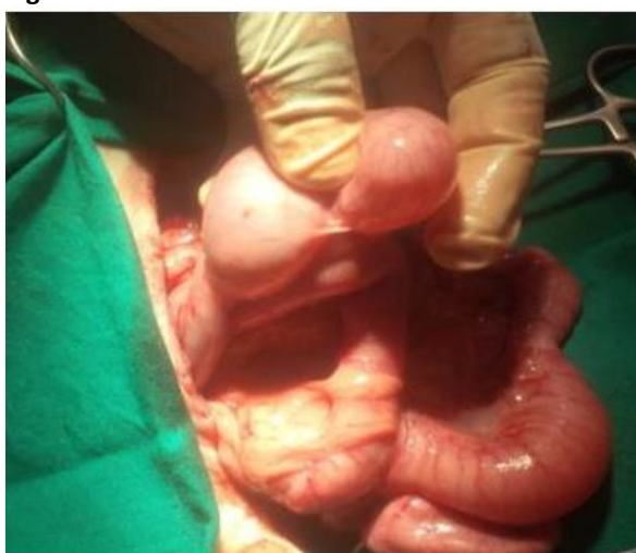
Figure 2: The large intestinal tract was exteriorized before measurement