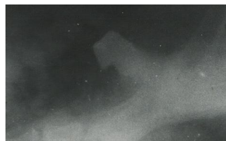
Plate III: Lateral abdominal radiograph after dorsal cystotomy taken immediately after the introduction of contrast showing dorsal irregularities of the dorsal wall with no evidence of contrast in the abdominal cavity. Note the straight border of the vertex and obvious indentation on the dorsal wall.