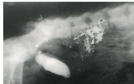
Plate I: Lateral abdominal radiograph after the ventral cystotomy (immediately following the introduction of contrast media) showing irregularities of the ventral wall with no evidence of contrast in the abdominal cavity.

The straight border on the vertex in all the radiographs most probably is as a result of extra luminal pressure produced by the small or large bowel. From this the study it is clear that as long as the surgical incision is adequately closed, there would be no likelihood of urine leakage so that wherever there is an indication for cystotomy, the choice of the site of incision should depend on the location of the lesion and the site which most adequately gives surgical exposure to the lesion.