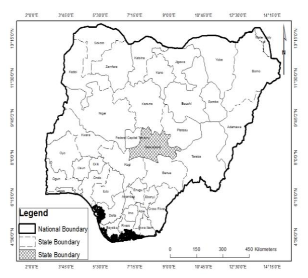
Figure 2: A map of Nigeria showing the position of Nasarawa State

Fourteen bulk milk samples were collected from the accessible Fulani settlements in each town selected for this study. The bulk fresh milk samples were collected after the milk has been collected and pooled. Twenty-two nono and locally-pasteurized