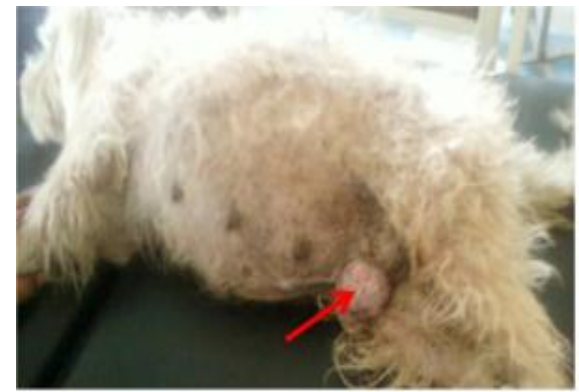
Plate VI: Twelve year old Lhasa apso with mammary adenocarcinoma two years after ovariohysterectomy was performed secondary to closed pyometra