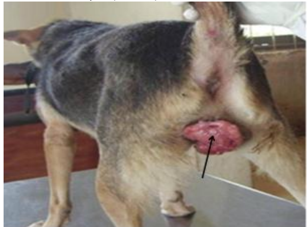
Plate IV: Four year old Alsatian cross with peri-vulva transmissible venereal tumour (Arrow)