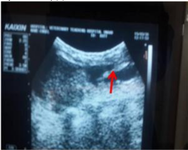
Plate V: Abdominal ultrasound of a five year old Rottweiler with intra-uterine foreign body (Arrow)