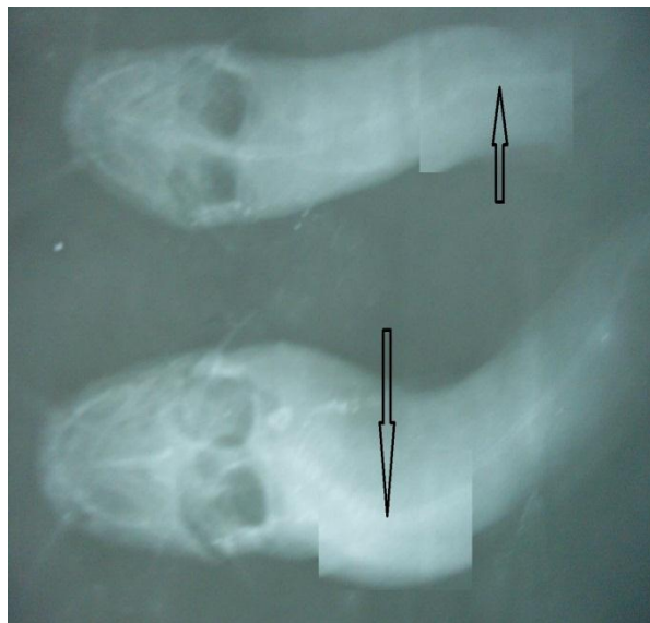
Plate I: Dorso-ventral view of skeletal image in laterally curved Heterobranchus longifilis

Diagnosis: Marked cranial scoliosis with a mild caudal scoliosis