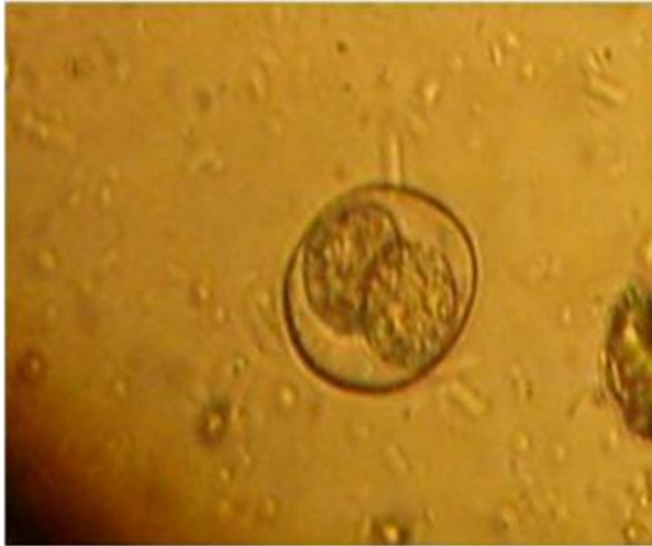
Plate V: Photomicrograph of isospora isolated from faecal sample of stray cat (X 100)