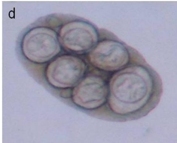
Plate III: Photomicrograph of dipylidium egg isolated from faecal sample of stray cat (X 400)