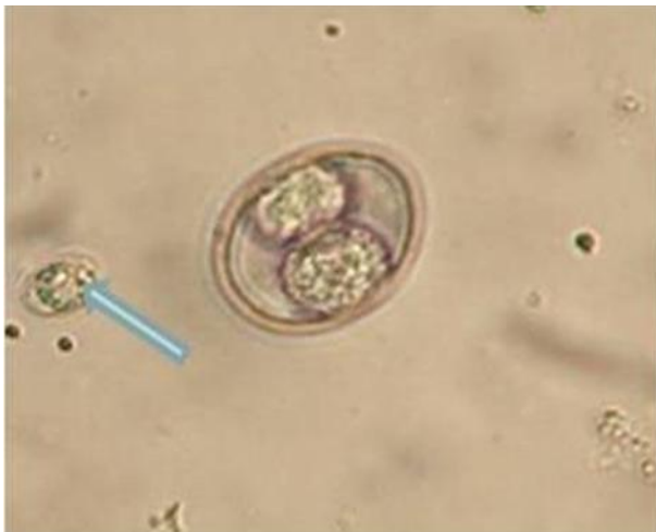
Plate VII: Photomicrograph of toxoplasma/hammondia (arrow) and isospora isolated from faecal sample of stray cat (X 100)