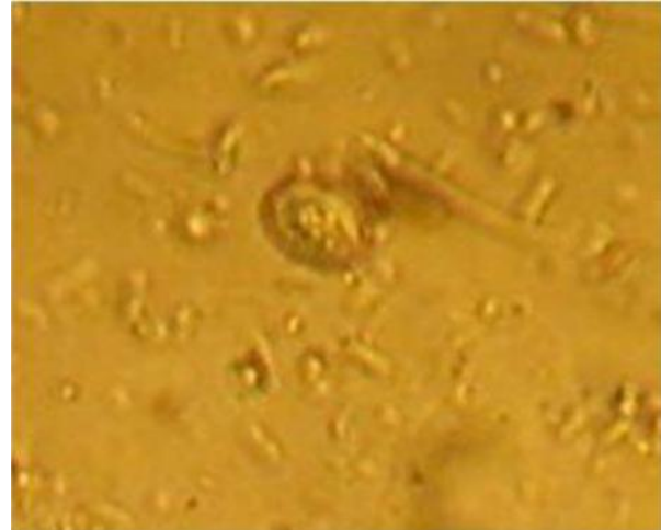
Plate VI: Photomicrograph of toxoplasma/hammondia isolated from faecal sample of stray cat (X 100)