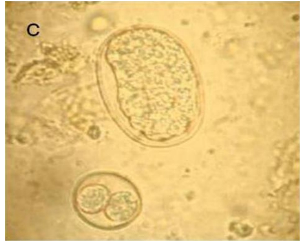
Plate II: Photomicrograph of strongyle egg and isospora oocyst isolated from faecal sample of stray cat (X 100)