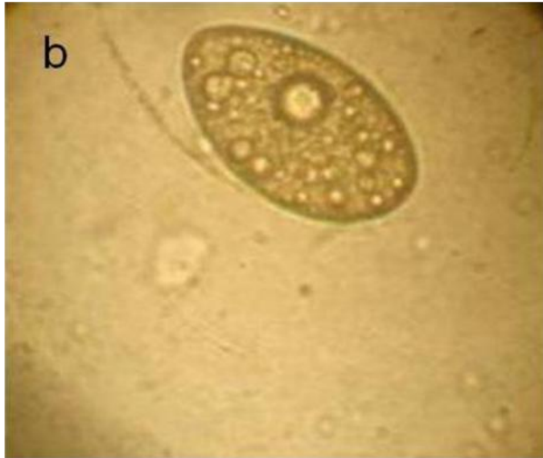
Plate I: Photomicrograph of spirometra egg isolated from faecal sample of stray cat (X 100)