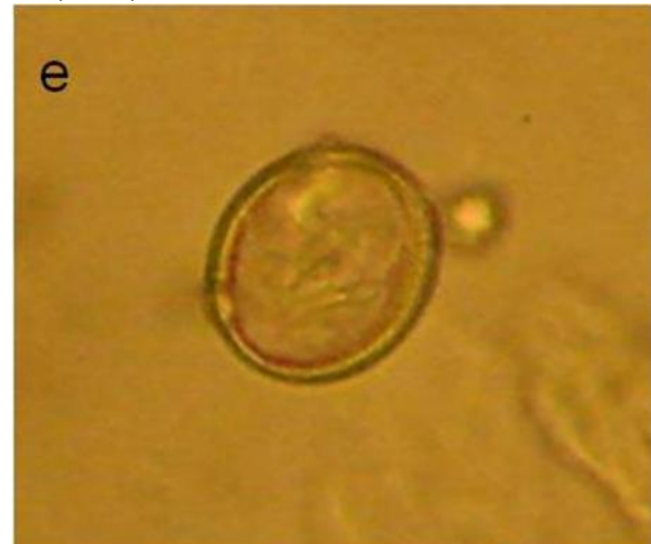
Plate IV: Photomicrograph of taeniid egg isolated from faecal sample of stray cat (X 100)